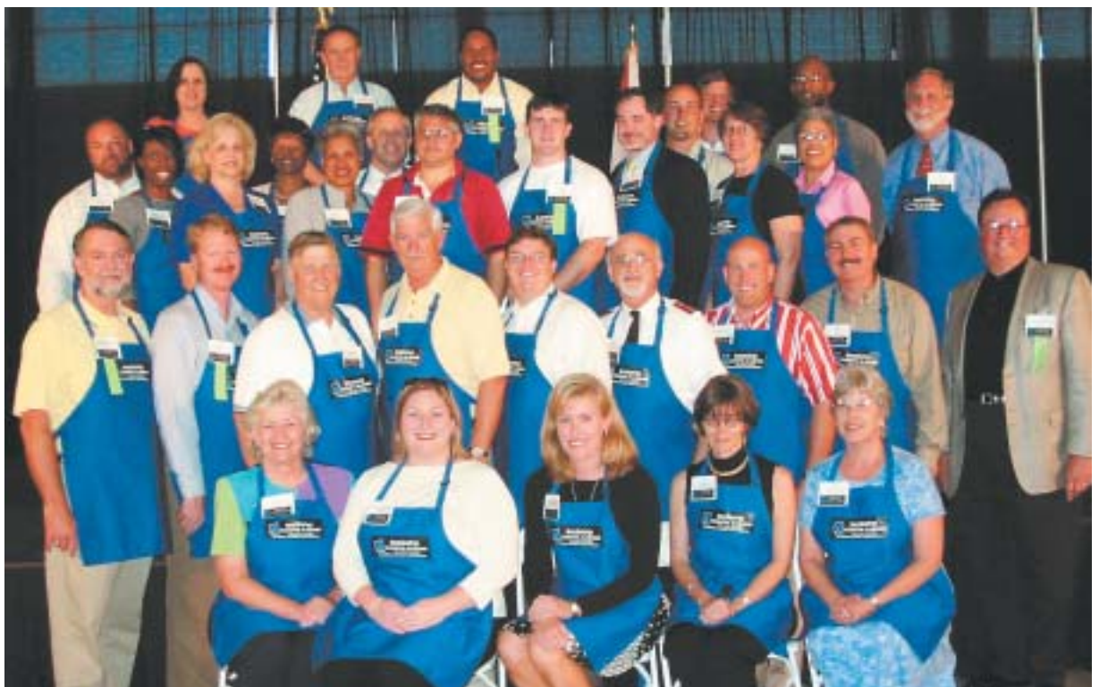
Members of the inaugural Leadership Coastal Alabama class held its culminating event in May at the USS Alabama Battleship, more than 250 elected officials in Mobile and Baldwin counties, along with chamber of commerce executives, Gov. Bob Riley and Rep. Jo Bonner, attended. The event was held to promote the cooperative spirit between the two counties and encourage further collaboration.